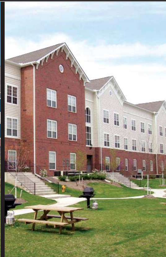
PENINSULAR PLACE 1000 North Huron River Drive, Ypsilanti, MI