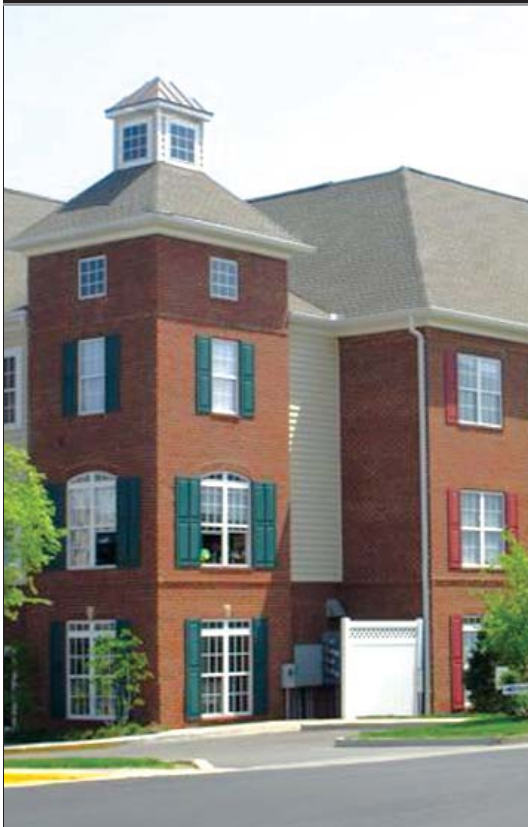
NEWTOWN CROSSING 359 Foreman Avenue, Lexington, KY