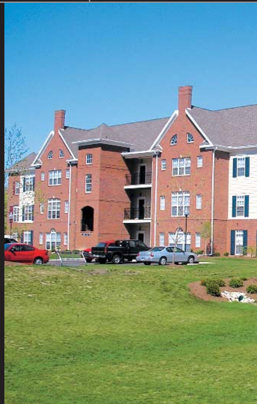
OLDE TOWNE UNIVERSITY SQUARE 1744 North Westwood Avenue, Toledo, OH